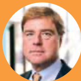
Bob Leasure Inotiv CEO

“Supported by deep, in-house expertise and scientific capabilities, we’re building a comprehensive contract pharmaceutical research solutions provider with a full spectrum of discovery and nonclinical services and research models into a unique, one-stop-shop, discovery-to-approval solution for drug developers.”